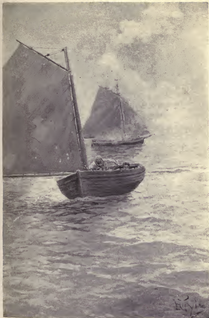
THE PIRATES FIRE UPON THE FUGITIVES